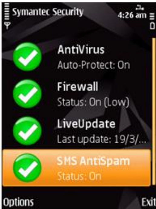
Figure 2. Security status screen on the device