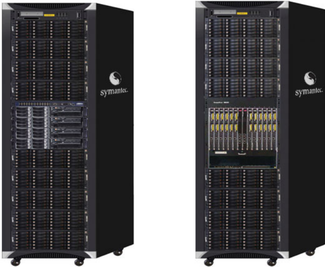
N8300 and N8500 systems

Highly scalable and available NAS solution