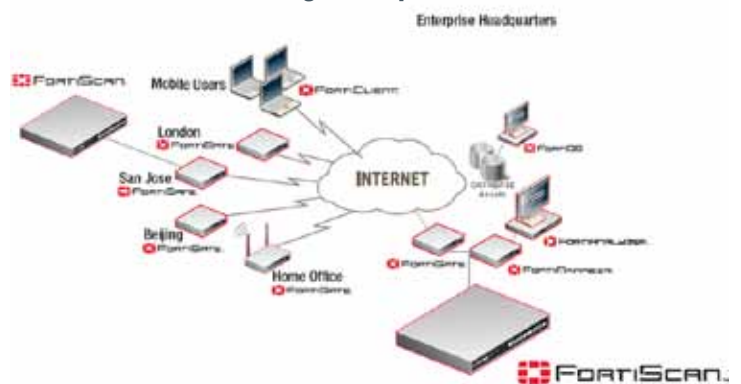
Thousands of IT Assets Remote Offices and Branches