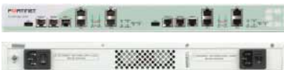
FortiBridge-2002 Front and Back