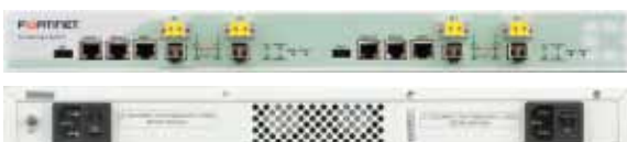
FortiBridge-2002F Front and Back

Enables you to add bypass functionality to any existing in line security system, including FortiGate ® multi-threat security systems.