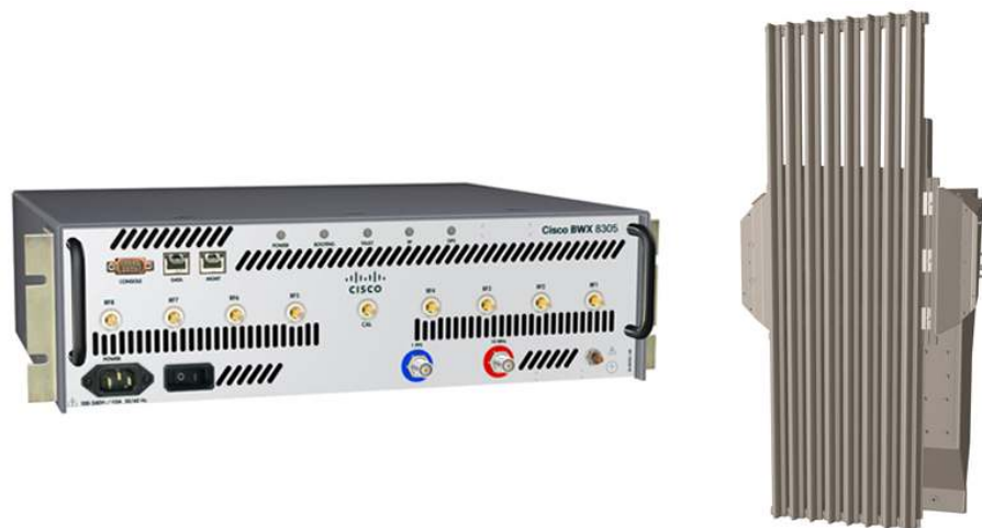
Figure 1. Cisco BWX 8305 Broadband Wireless Access System