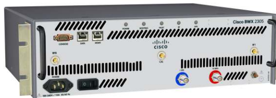
Figure 1. Cisco BWX 2305 Basestation