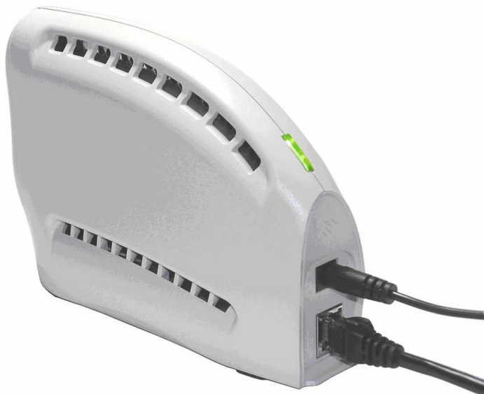
Figure 1. Cisco BWX 210 Desktop Modem