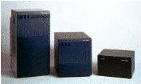
Figure 1. Cisco 7500 Series Router

The Cisco ® 7500 Series router is the premier Cisco distributed services, multiprotocol platform, now with twice the performance and enhanced high-availability (HA) features. The Cisco 7500 Series combines proven Cisco software technology with exceptional reliability, availability, serviceability, and performance features to meet the requirements of today's most mission-critical networks. The Cisco 7500 Series router provides service provider and enterprise networks with the flexibility they need to meet the constantly changing requirements of their networks. The three models of the Cisco 7500 Series allow users to choose the exact configuration needed to optimize installations and network designs for cost and functionality.