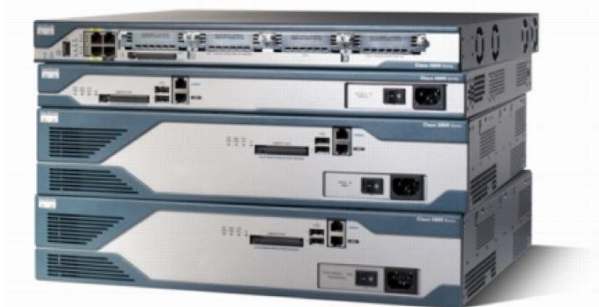
Figure 1. Cisco 2800 Series

Cisco Systems ® , Inc. is redefining best-in-class enterprise and small- to- midsize business routing with a new line of integrated services routers that are optimized for the secure, wire-speed delivery of concurrent data, voice, video, and wireless services. Founded on 20 years of leadership and innovation, the Cisco ® 2800 Series of integrated services routers (refer to Figure 1) intelligently embed data, security, voice, and wireless services into a single, resilient system for fast, scalable delivery of mission-critical business applications. The unique integrated systems architecture of the Cisco 2800 Series delivers maximum business agility and investment protection.